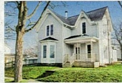
VERNON, MI $97,900 1,541 square feet 3 beds, 1 bath