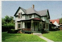
HARLAN, IA $97,500 2,676 square feet 4 beds, 2 baths