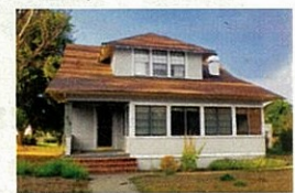
BASIN, WY $89,900 3,587 square feet 3 beds, 1.5 baths