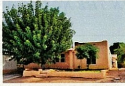
TRUTH OR CONSEQUENCES, NM $80,000 1,500 square feet 3 beds, 2 baths