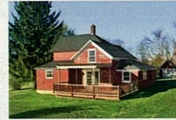
HARMONY, MN $85,000 1,216 square feet 2 beds, 1.25 baths