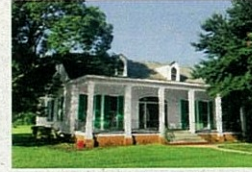
JEANERETTE, LA $95,000 2,260 square feet 3 beds, 2 baths