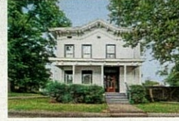
BLOOMINGTON, IL $75,000 3,336 square feet 4 beds, 2 baths