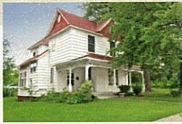
POPLAR BLUFF, MO $54,900 1,320 square feet 4 beds, 1.5 baths