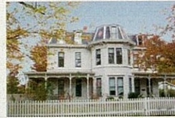
BLUE MOUND, KS $49,000 2,760 square feet 4 beds, 2 baths