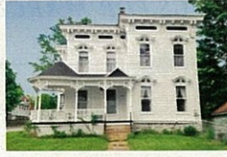
COLD BROOK, NY $75,000 2,686 square feet 4 beds, 2 baths