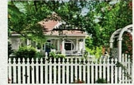
MCCOMB, MS $99,900 2,239 square feet 4 beds, 2.5 baths