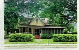
STARKE, FL $100,000 1,307 square feet 3 beds, 2 baths