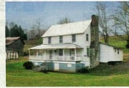
MORRISTOWN, TN $79,900 1,840 square feet 3 beds, 1 bath