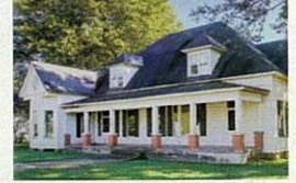
MURFREESBORO, AR $58,900 2,887 square feet 6 beds, 6 baths