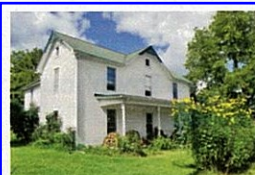
RENICK, WV $89,900 2,460 square feet 4 beds, 1 bath