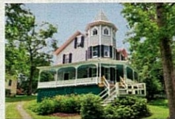
MOUNTAIN LAKE PARK, MD $79,999 2,184 square feet 6 beds, 3 baths