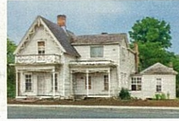
ROSEBURG, OR $99,000 2,424 square feet 4 beds, 1 bath