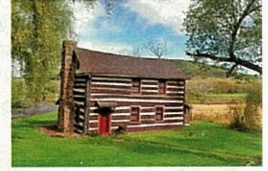
SPRING MILLS, PA $79,000 1,566 square feet 3 beds, 1 bath