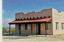
YUCCA, AZ $96,500 1,200 square feet 1 bed, 1 bath