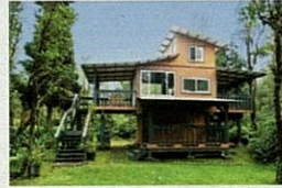
MOUNTAIN VIEW, HI $50,000 288 square feet 1 bed, 1 bath