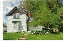
PALOUSE, WA $79,900 1,200 square feet 2 beds, 1 bath