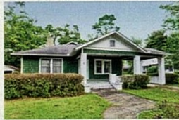
VALDOSTA, GA $97,500 1,834 square feet 3 beds, 1 bath