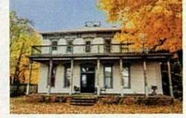
NEW RICHMOND, IN $64,000 2,081 square feet 4 beds, 1 bath