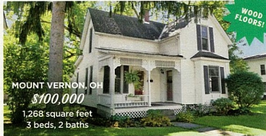
MOUNT VERNON, OH $100,000 1,268 square feet 3 beds, 2 baths