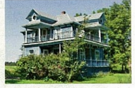
GREAT BEND, ND $74,900 2,250 square feet 3 beds, 2 baths