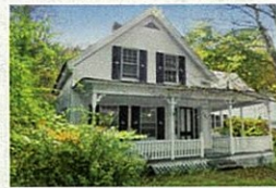
WILLIAMSVILLE, VT $49,900 1,700 square feet 3 beds, 1 bath