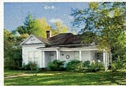
KERSHAW, SC $69,900 1,557 square feet 2 beds, 1.5 baths