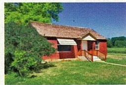
VERNAL, UT $84,900 1,114 square feet 2 beds, 1 bath