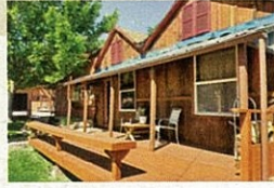
PIOCHE, NV $89,000 1,282 square feet 3 beds, 1.75 baths