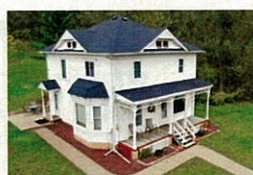
STEUBEN, WI $84,900 1,140 square feet 3 beds, 2 baths