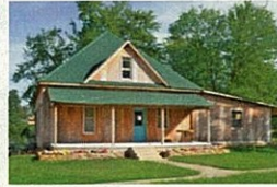
WAGONER, OK $95,000 2,116 square feet 3 beds, 2 baths