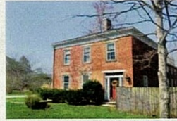
DOVER, KY $98,000 2,880 square feet 4 beds, 2.5 baths