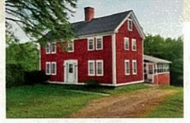
OSSIPEE, NH $99,900 2,145 square feet 3 beds, 2 baths