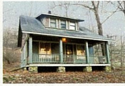
GLEN GARDNER, NJ $85,000 1,398 square feet 2 beds, 1 bath