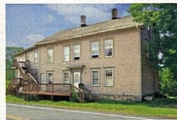
RICHMOND, RI $98,000 2,880 square feet 6 beds, 3 baths