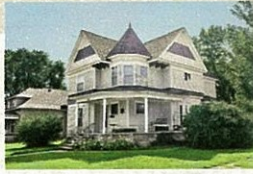
RED CLOUD, NE $95,000 2,500 square feet 4 beds, 2 baths