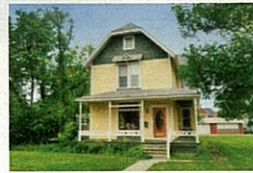
ABERDEEN, SD $84,900 3,234 square feet 3 beds, 1.5 baths