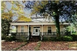
EUFAULA, AL $89,900 2,343 square feet 4 beds, 2 baths