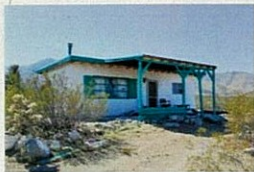
LUCERNE VALLEY, CA $90,000 400 square feet 1 bed, .75 bath