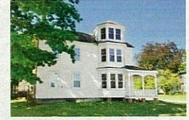
EASTPORT, ME $85,000 3,700 square feet 6 beds, 1 bath