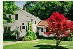
ADAMS, MA $59,900 2,360 square feet 3 beds, 3 baths