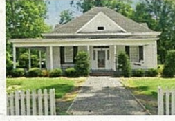
GIBSON, NC $89,900 1,660 square feet 3 beds, 2 baths