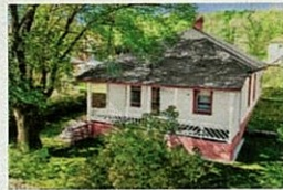
COKE DALE, CO $65,000 unknown square footage 2 beds, 1 bath