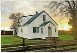
JOPLIN, MT $69,000 1,700 square feet 3 beds, 1 bath