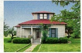
LORAIN, TX $65,000 1,771 square feet 3 beds, 2 baths