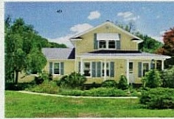
WILLIMANTIC, CT $99,000 1,238 square feet 3 beds, 1 bath