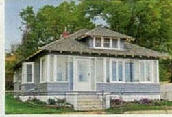
ARCO, ID $65,000 1,128 square feet 2 beds, 1 bath