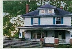
LAUREL, DE $89,000 unknown square footage 3 beds, 2 baths