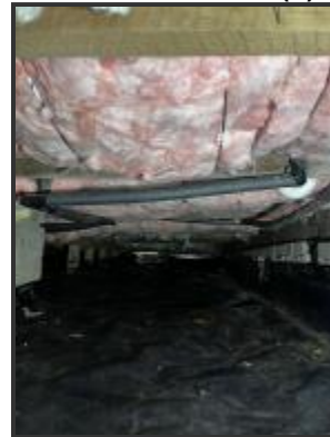
Crawlspace insulation & vapor barrier