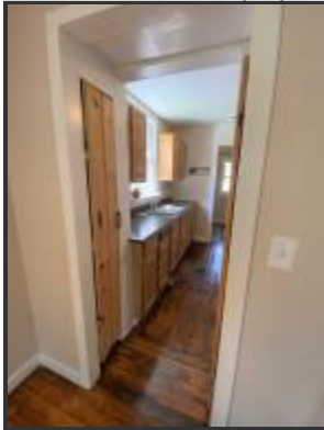
Entry to Kitchen from Living Room