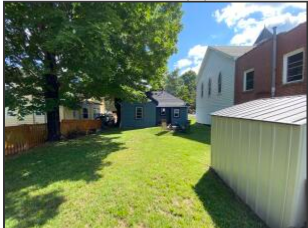
View from back of lot towards house