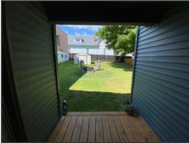
View of yard from back porch