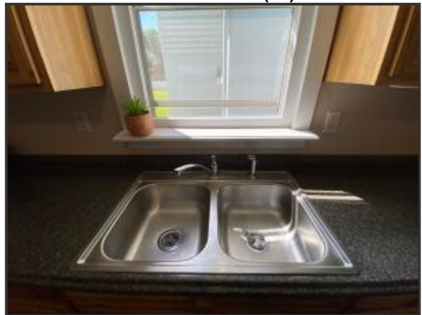
Kitchen sink (the kitchen window is the only non-replacement window)