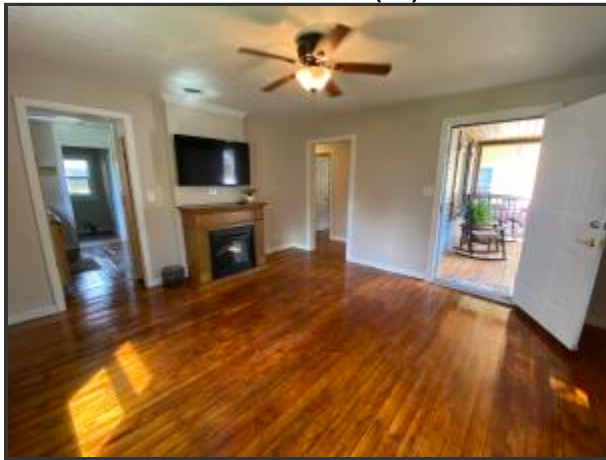
Living Room/door to Front Porch