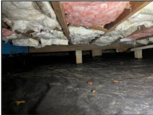
Crawlspace insulation & vapor barrier